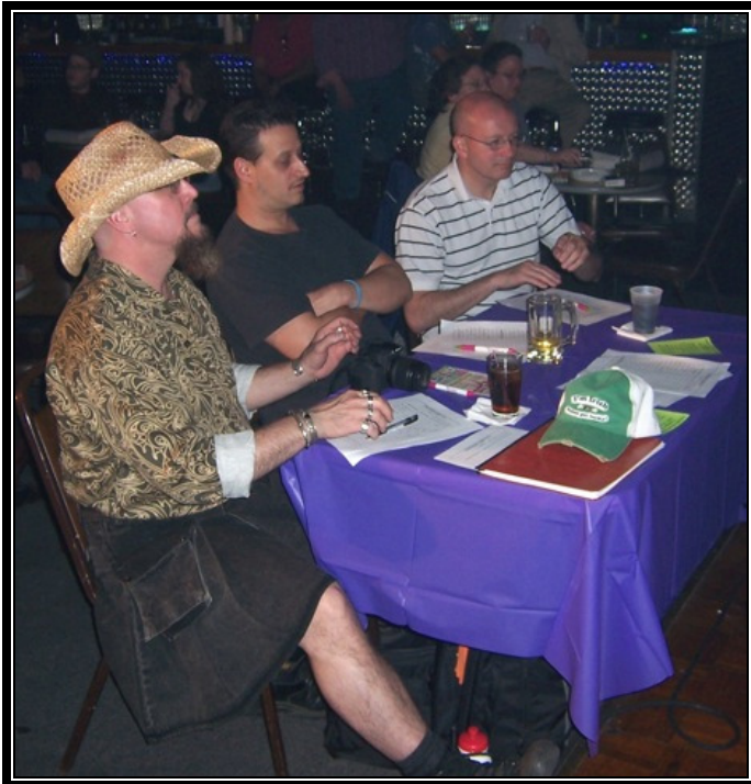
Judges prepare to vote as they listen intently to the Karaoke Singers!

long time dedication to the community and his activism and fund raising efforts.