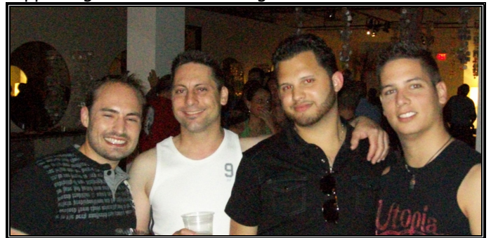
Revelers enjoy the evening at Takeover Fundraiser for FACT