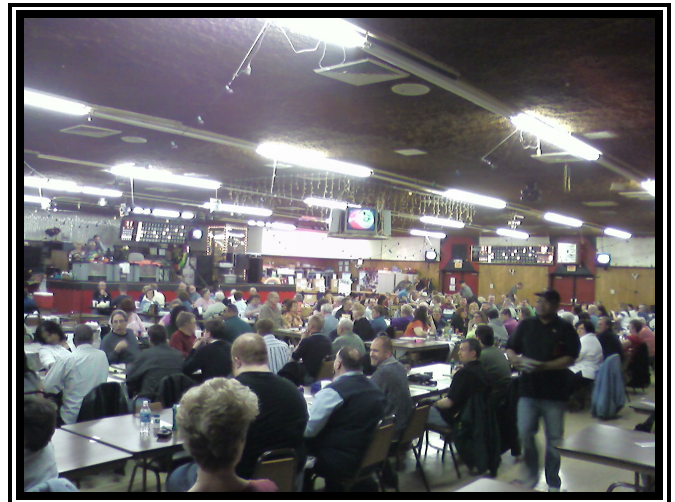
BINGO Players intensely listening for their numbers!