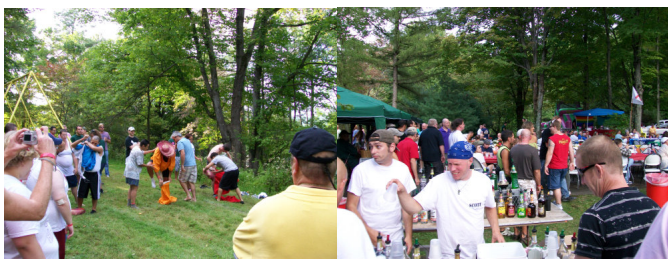
Teams participate in drag race.

Of course the focus of the day was on the teams participating in the events organized by the co-chairs of the Games. When the events were over, Diamonz Bar in Bethlehem, once again won first place and retained the trophy. The Stonewall in Allentown won second place and Metropolitan Community Church of the Lehigh Valley won third place! This year the Games raised $13000. A debt of thanks is owed to Rainbow Mountain Resort and their staff who have hosted the FACT Summer games since the beginning. Their dedication and willingness to help FACT makes the work of running the games every year much easier. When you visit Rainbow Mountain, please let them know how much we appreciate their generosity!