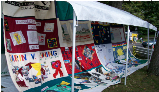
AIDS Memorial Quilt Displayed during the FACT Summer Games.