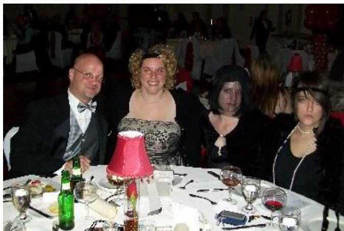
Some Snowball attendees in period dress!