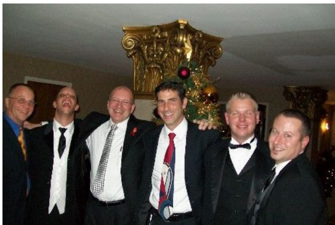
Friends old and new enjoying the cocktail hour in the Lobby of the Hotel Bethlehem.