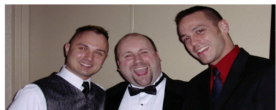
More Laughs and fun by attendees at the Snow Ball!

Outside a cold snowy night greeted the 150 revelers who attended the Twenty First Annual Snow Ball held on Sunday, December 2, 2007, at the Crown Plaza Hotel, Ninth and Hamilton Streets, Allentown. Inside, the atmosphere and an abundance of food and drink warmed the crowd that gathered! Over 90 silent auction