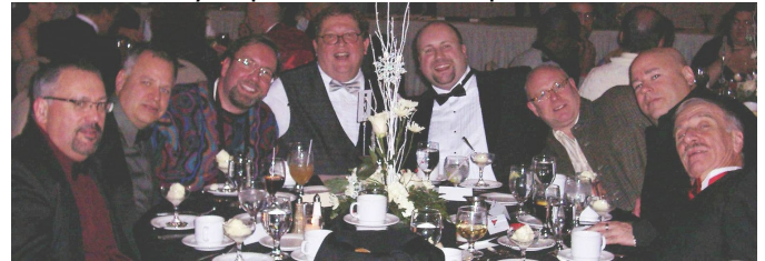
A group of "Revelers" enjoying the fine food and Fellowship of the Snow Ball!

items, donated by area businesses and individuals added to the excitement of the night as bidders kept watch over what they hope would be their prize!