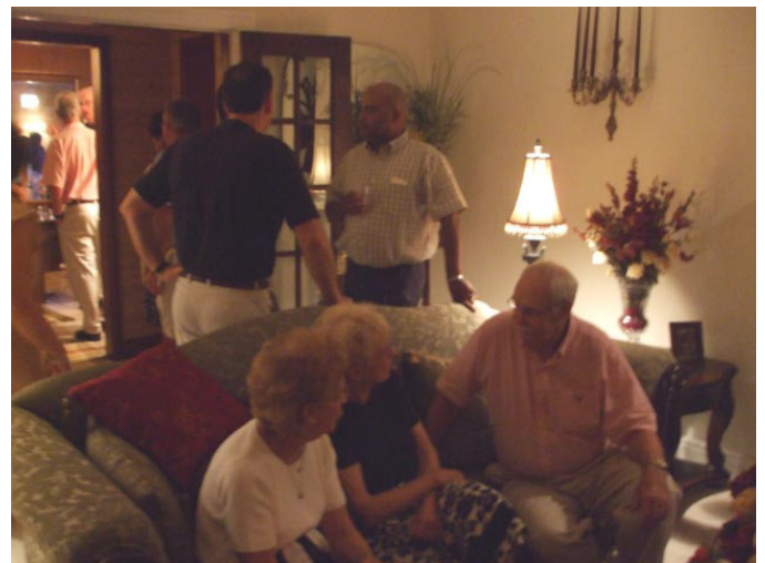
Attendees enjoying the pre-dinner conversation in the parlor.