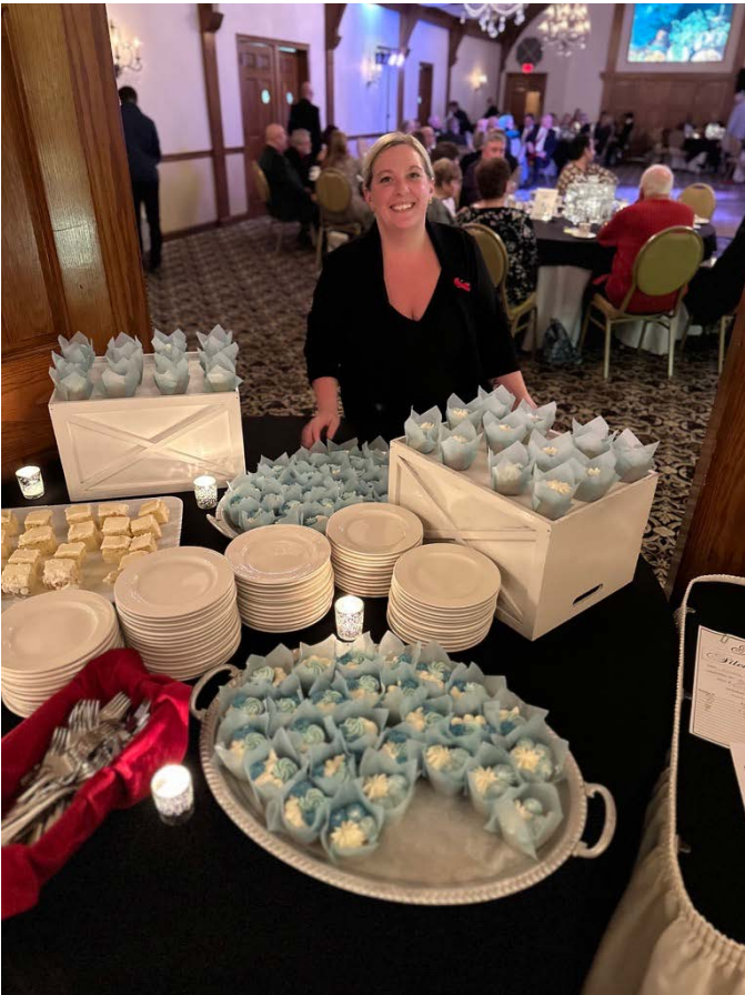
Cupcakes courtesy of Virella's Bakery.

Life is like a sea. We are moving without end. Nothing stays with us. What remains is just the memories of some people who touched us as waves.