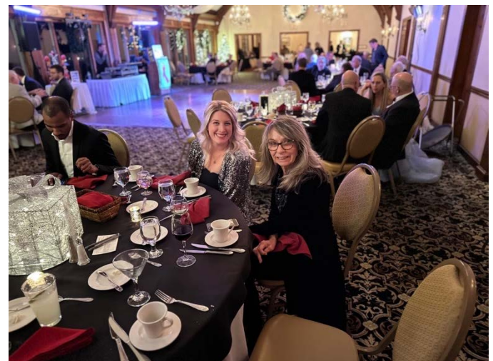
Attendants anticipating the main course.